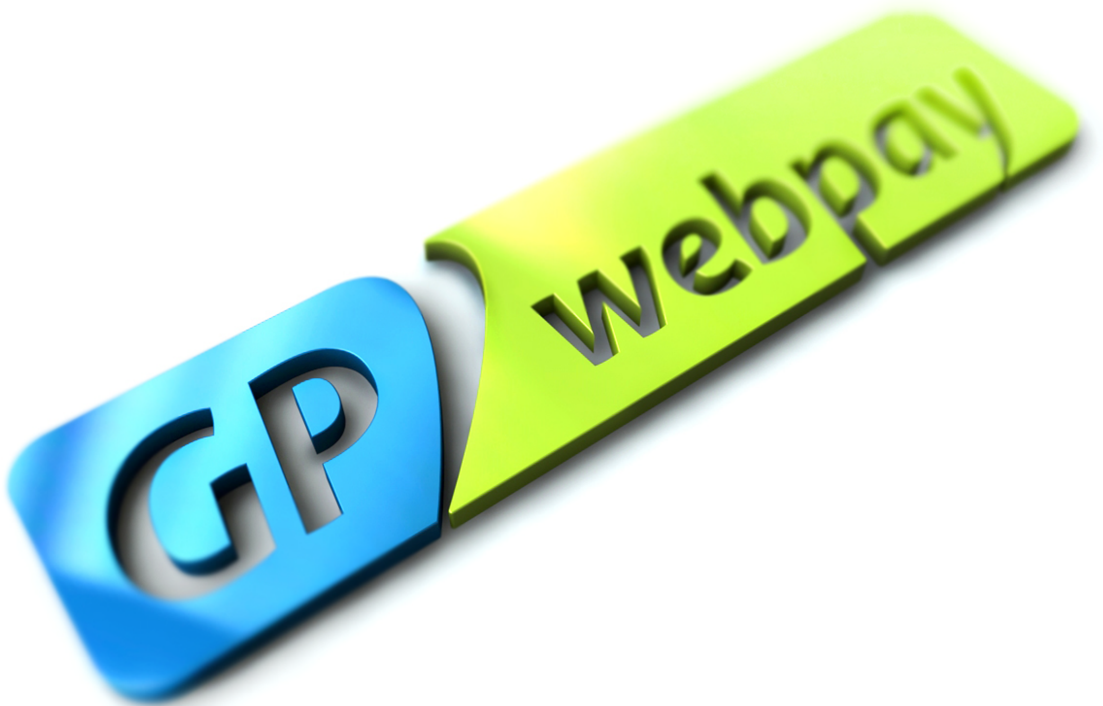
3D visual of the logo