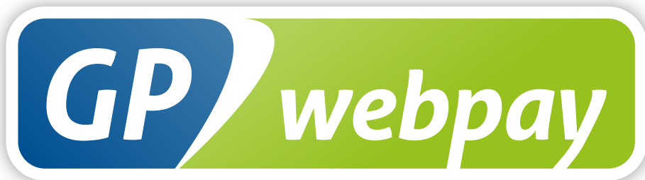
variations of the logo outline